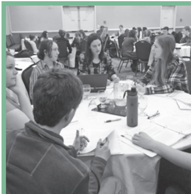
People on the education committee meet and discuss their bills before deciding which bills to move from committee to the floor for debate by the full 4-H Senate.